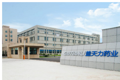
Huaier raw material manufacturing plant