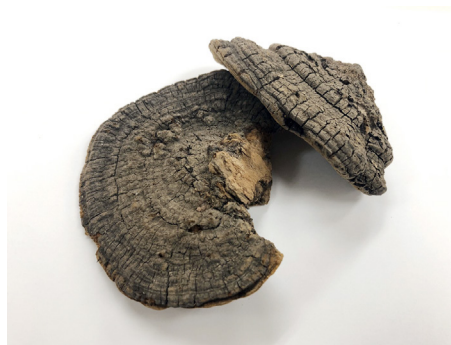
The fruit body of huaier fungus.

In present-day Japan, huaier is treated as a "food-only" medicinal herb.